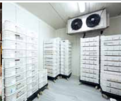
Warehouse & Distribution