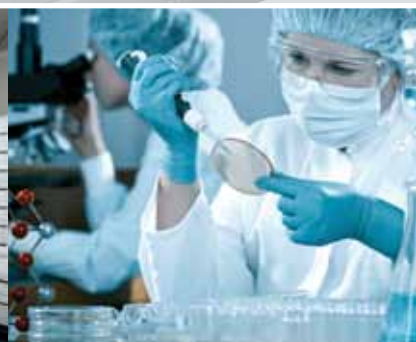
Industrial & Scientific